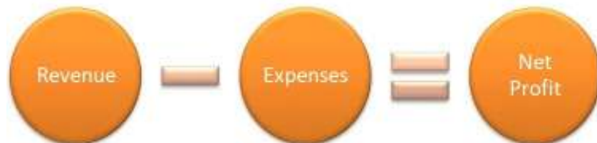
Net Profit Formula

Revenue in the double-entry bookkeeping system is one of the five account groups where financial transactions can be recorded. The other four are assets, liabilities, owners equity and expenses. Revenue accounts are created in the general ledger to record the various ways that the entity earns it.