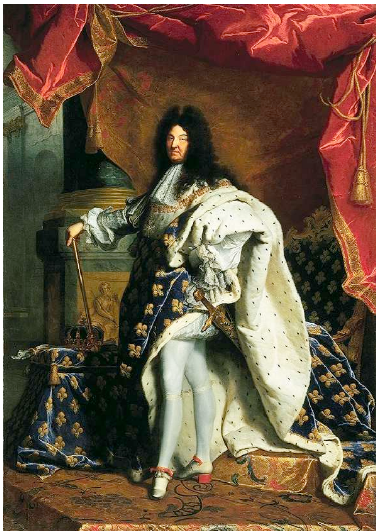
Hyacinthe Rigaud, Louis XIV, King of France and Navarre, oil on canvas, 1701 (Musée du Louvre, Paris)

In France, Louis XIV (who reigned from 1661 to 1715), also known as the "Sun King," centralized the government around his own person and used art and architecture in the service of the monarchy. The French monarchs ruled with absolute power, meaning that there was little or no check on what they could and could not do. There was no parliament that would have balanced the power of the King (as there was in England). The King also ruled, so it was believed, by divine right. That is, that the power to rule came from God. In an effort to use art in support of the state, Louis XIV established the Royal Academy of Fine Arts to control matters of art and artistic education by imposing a classicizing style as well as other regulations and standards on art and artists.