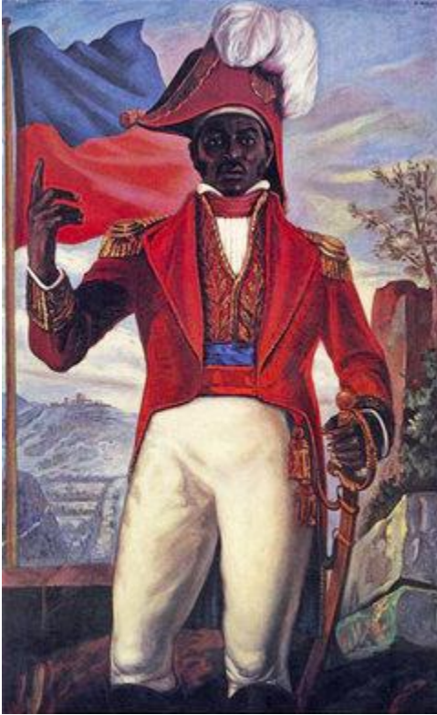
Portrait of Jean-Jacques Dessalines.