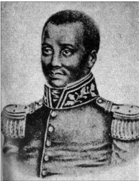
Portrait of François Capois "La Mort".