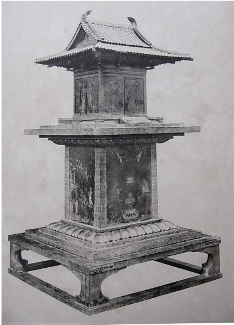
Tamamushi Shrine, c. 650. Cypress and camphor wood, with lacquer and paint. Height: 84 inches. Hōryū-ji Treasure House.

Terms of Use: The image above is in the public domain.