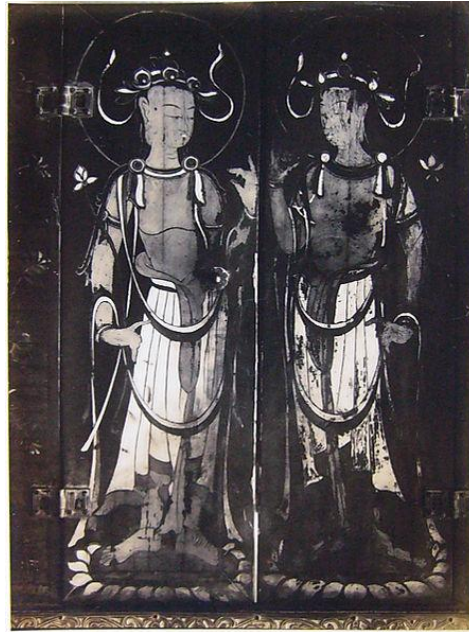
Bodhisattvas depicted on the side doors of the Tamamushi Shrine.

metalwork of the pedestal and the image hall were covered with the iridescent wings of tamamushi or beetles, from which the shrine takes its name. The shrine is an important example of Asuka period architecture as only two real Asuka period buildings—the Golden Hall and Pagoda of Horyū-ji—survive.